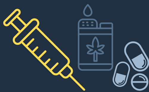
Greatest risk to area Teens is Fentanyl, Marijuana, and Methamphetamines (including Adderall and Ecstasy)

We had called several other teen programs in Houston looking for help for our teen daughter. She was being discharged from inpatient treatment and she needed a support program. We had already maxed out our insurance plan and would be paying out of pocket. After the last place told me it would be $900 a month, I felt completely lost. We desperately needed help for our baby girl.