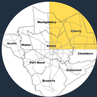
1 in 4 Area teens have vaped or do vape regularly, and rising